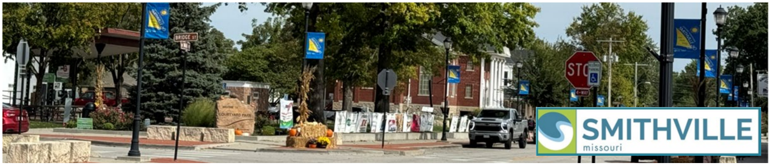
Figure 1 - Downtown Smithville